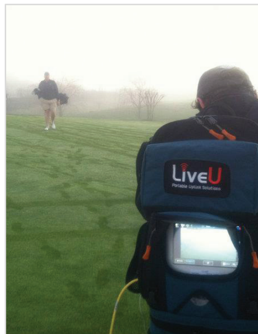
Golf Channel PGA

Golf Channel repeated the project with LiveU in the subsequent two years (2012 and 2013), using LU70 units in the 2013 qualifiers with a similar workflow.